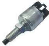
Break Light Switch