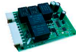
Electronic Control System