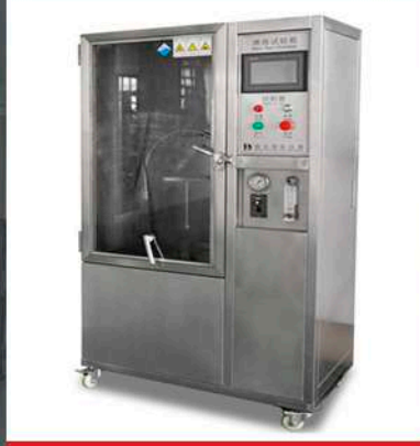
WATER SPRAY CHAMBER