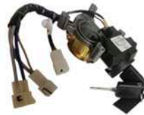
Ignition starter switch