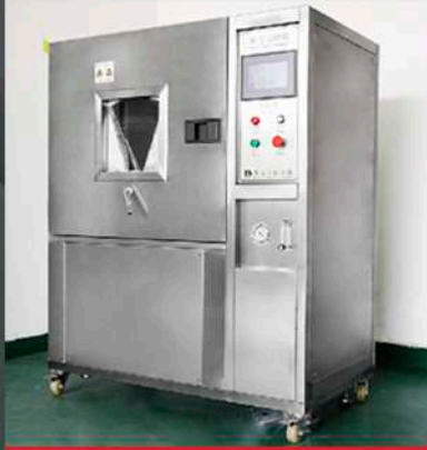
DUST SPRAY CHAMBER