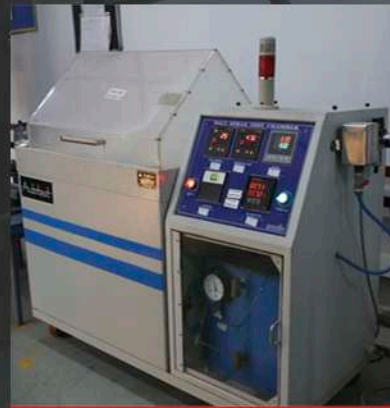
SALT SPRAY CHAMBER